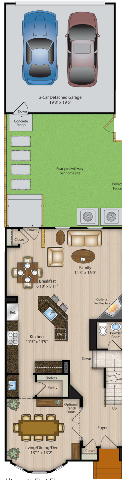
Alternate First Floor