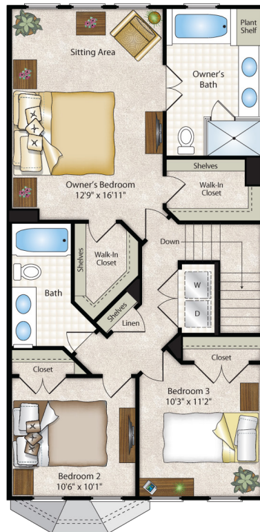
Second Floor - Elevations 1, 2, 3A & 4A